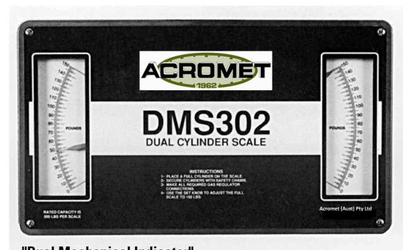
"Dual Mechanical Indicator"